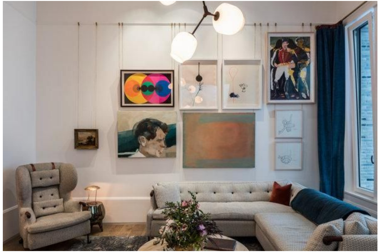
A model apartment in the sales gallery for a new condominium development at 180 East 88th Street in Manhattan. The developers DDG have included picture rails in the units, which can be used to hang artworks — these are from online galleries — from chains.